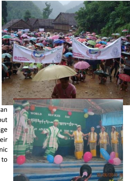
Various Cultural and Traditional Performance on the World Refugee Day, June 20, 2012.

COERR also deem it significant to draw the refugees' presence to the world attention and therefore have our concern Field Offices, such as COERR Mae Hong Son, COERR Mae Sariang, COERR Mae Sod, COERR Kanchanaburi, COERR Bangkok Refugee Center and COERR Program for the Immigration Detention Center, to organize a ceremony in their respective area to open an opportunity for the refugees they work with to learn about social communication that reflect their values and prestige and how to live together in peace and harmony, through their participation in individual cultural, traditional and multi-ethnic performance they represent, and have Refugee Speech to commemorate the World Refugees Day.